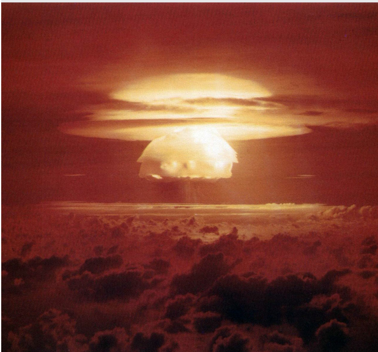
The mushroom cloud of the 15 megaton Bravo test on Bikini Atoll in March 1954. The test, carried out as part of Operation Castle, was the largest nuclear device ever detonated by the United States.

Eventually, the people of Rongelap were evacuated, although by then fallout had made many of the atoll's inhabitants sick. Some returned in 1957, but self-evacuated in 1985 with help from Greenpeace. More than 60 years after the Bravo test, the Rongelap islanders are still unable to go home because of residual radioactive contamination, which poses a risk to humans and the environment. 19 Marshall Islanders, especially those from Rongelap, have encountered higher than normal rates of cancer including thyroid cancer and leukemia since nuclear tests ended. 20